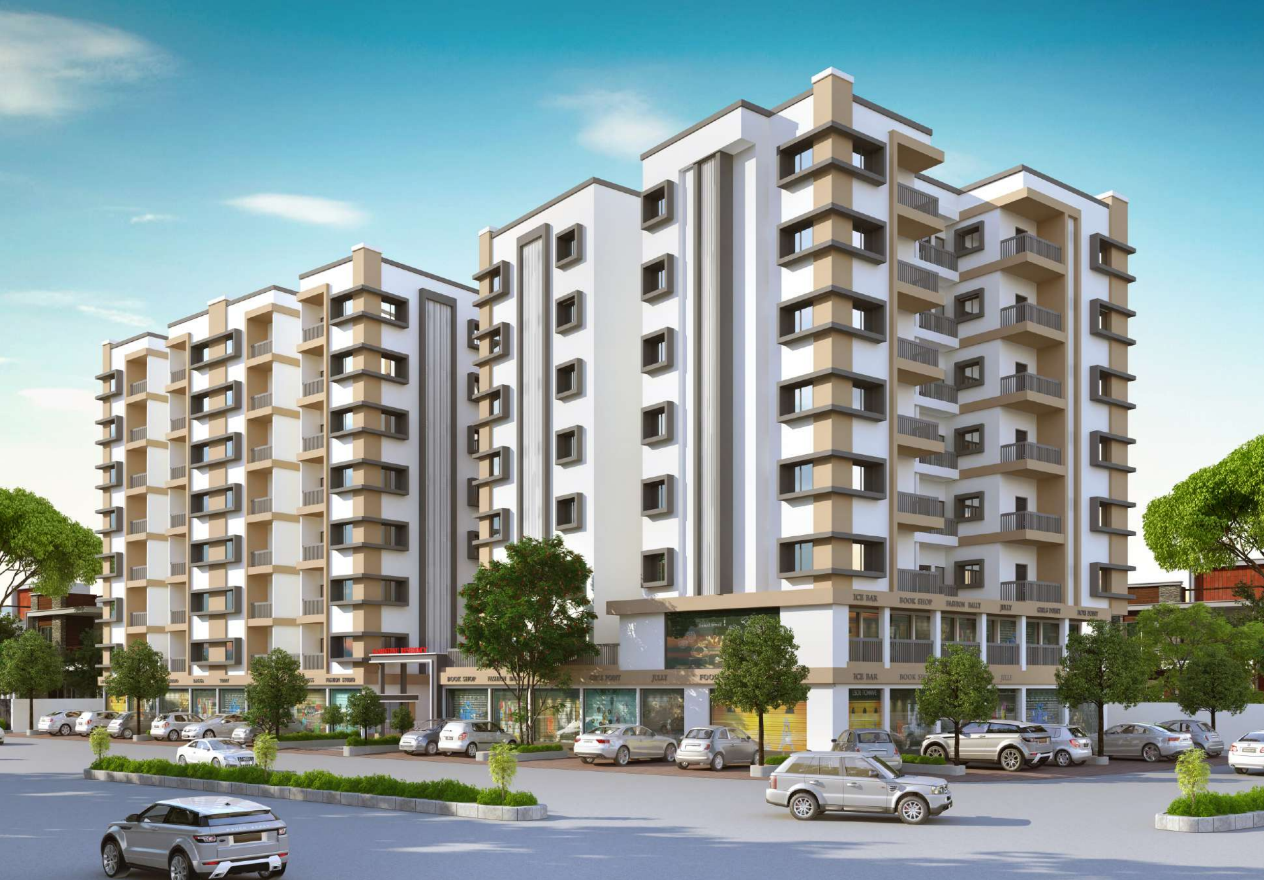
3 BHK ~ Tower A